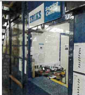
Use of barrier screens at service counters