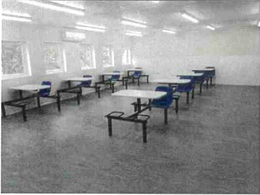
Canteen areas restricted with maximum occupancy to achieve Social Distancing