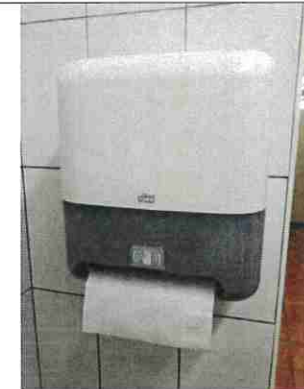
'Touchless' hygiene equipment in place