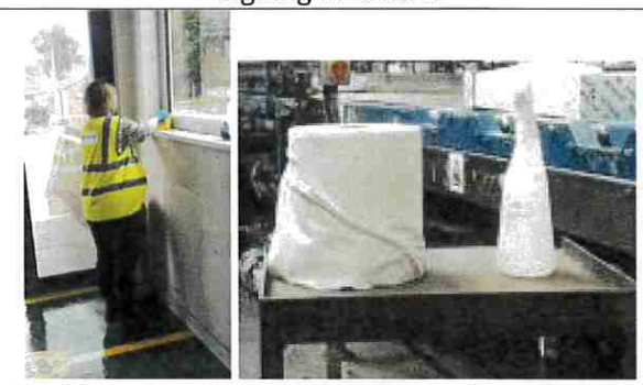
Additional sanitising resources implemented and workstations issued with sanitising equipment.