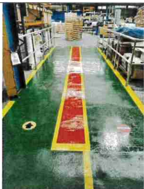
Walkways clearly marked and 1 way systems in use where possible.