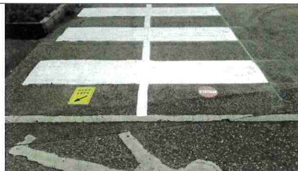
Main Pedestrian walkways made 'double width' to ensure social distancing is achievable.