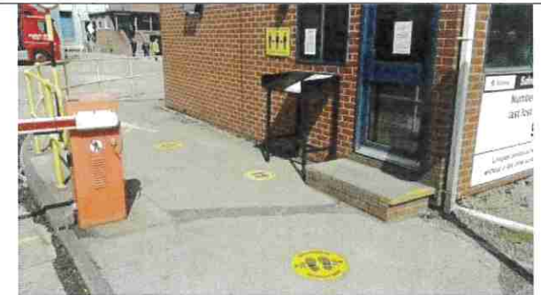
Use of visual aids to emphasize distancing at main signing in centre.