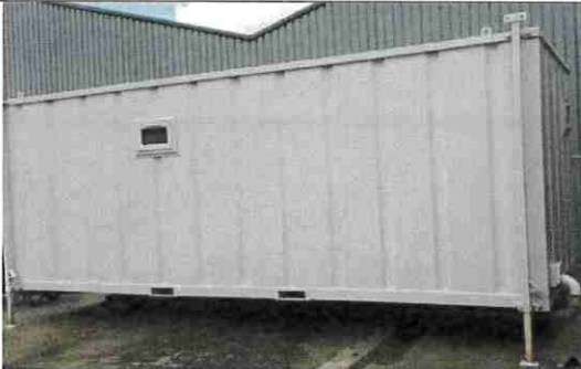
Additional Welfare Facilities to dilute employee No.s