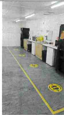
Social Distancing signage and clearly marked zones